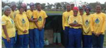
S. September and Team