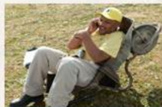
A successful Project Man